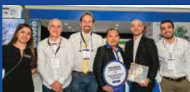
VICTORIOUS TEAM PROVIDER CORPORATION

The 4 th International Processing and Packaging Trade Event for the Philippines