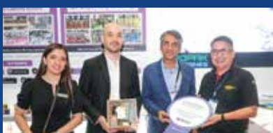
CLEARPACK SINGAPORE PTE. LTD.