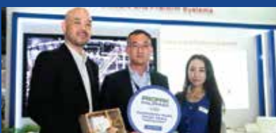
SHANGHAI ONLYTEC INDUSTRY CO., LTD