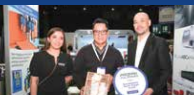
ADHESIVES AND PAINTS APPLICATIONS SYSTEMS, INC.

ProPak Philippines gave recognition to its exhibiting companies who have the same goals with us on sustainability. Here are the recipients of our sustainable booth design awards: