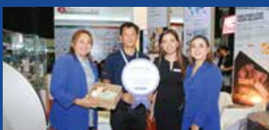
RIECKERMANN PHILIPPINES, INC.