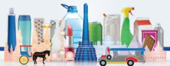
F. BOTTOM BANNER AT HOME PAGE